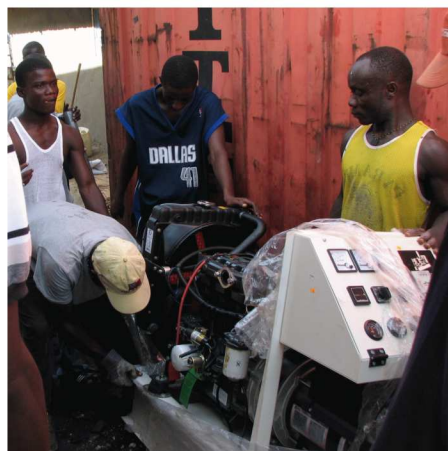
The new 13.5kva Lister Petter generator.