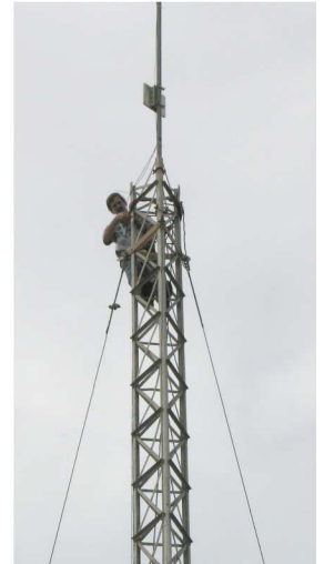
Installing wireless bridge antennas.

While I was originally supposed to present the seminar myself, we are actually thrilled about the reason I was unable to travel to Burkina Faso: We are expecting our first baby the first week of November. We