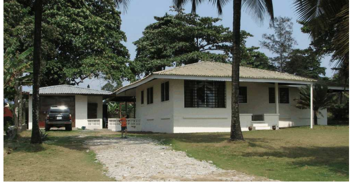
February, 2014– Thank you, Lord!