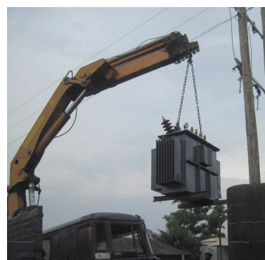
LEC transformer installed at the ELWA power house

hospital and campus (which is likely to be needed from time to time). The actual switch to LEC & 50 Hertz is still a few months ahead; the new ELWA hospital itself should be open in early 2015. Pray that God will provide the funds needed to make these important upgrades.