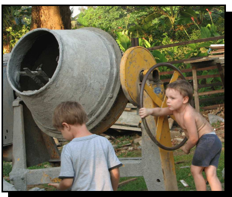
..."helping" in any way they could! (Don't worry— the cement mixer is empty!)