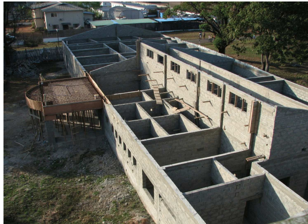
New Radio ELWA studio under construction

Radio ELWA's new studio is ever closer to completion of phase 2, which means roof, walls, windows and doors. From the boys getting rides in the caterpillar as it was clearing the construction site to Cheri getting Alan-guided tours during different phases of building, we have really had fun feeling a part of it all.