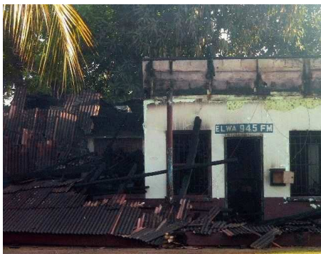
The Radio ELWA studio, housed in a garage since the war, burned down in November, 2011

had requests from churches in Nigeria to start broadcasting their programs again on shortwave!