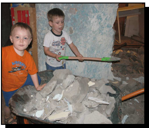
It was such a challenge...