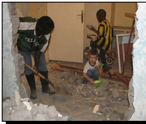
...when we had to live with the construction messes inside.