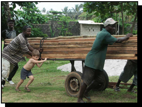
Construction needed to be done here at home, too, and the boys put their backs into the projects...