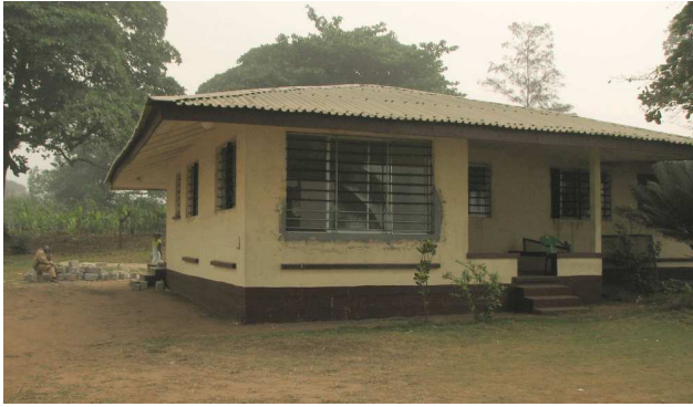
Our house up until this fall