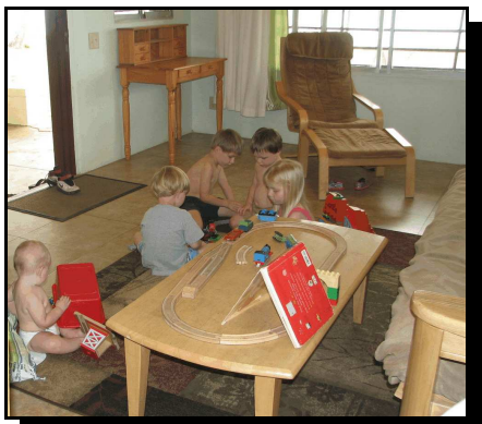
Inside play is so much tidier now...