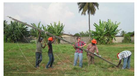
Setting up the new 4.76MHz shortwave antenna, Dec. 2013