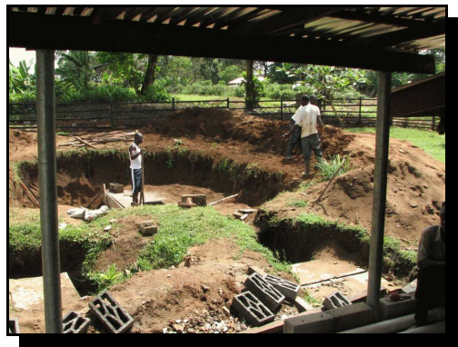
Putting a new septic system in our backyard...