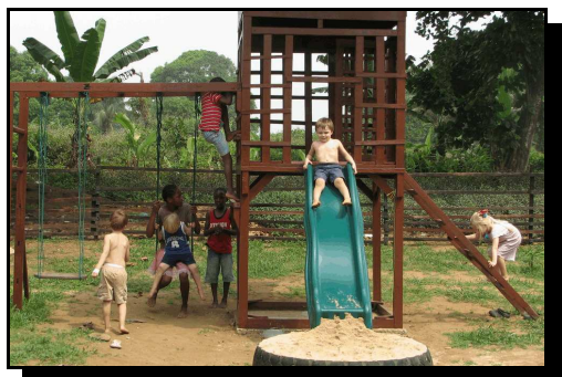
Inherited, refurbished playhouse— just add kids!

There were frustrations along the way, especially with getting the garage roof built properly. (For instance, screws were nailed in making a loose, "holey" roof, and we couldn't open the doors because of incorrect roof slope!) The most difficult parts are done now though and we are so thankful for the home the Lord has blessed us with!