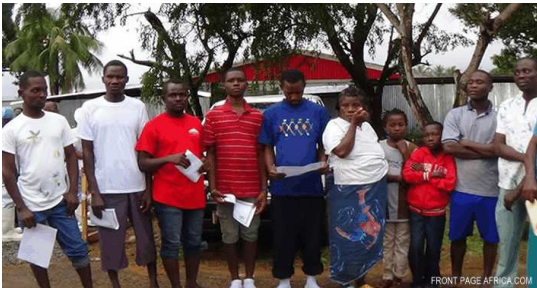
Patients from “ELWA 2” receive their Ebola Discharge Certificate