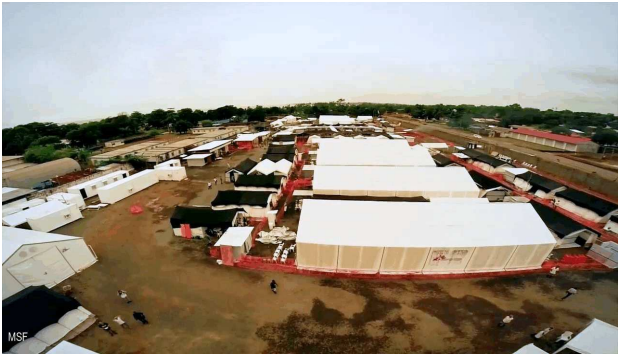
“ELWA 3” (MSF)