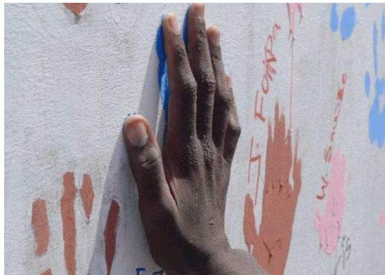
"Wall of Survivors" at MSF's ELWA3 Ebola Treatment Unit

We had just purchased plane tickets a year ago March, for a six-month home assignment to begin in July, when Ebola cases started showing up near Monrovia. SIM strongly recommended that families with young children leave "for a few months".