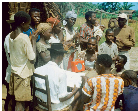
Listening to ELWA Radio on a pre-tuned radio.

Work continues for Alan on the final phase of the studio (studio equipment, lightning protection, etc), so ELWA can begin producing programs in Liberian languages.