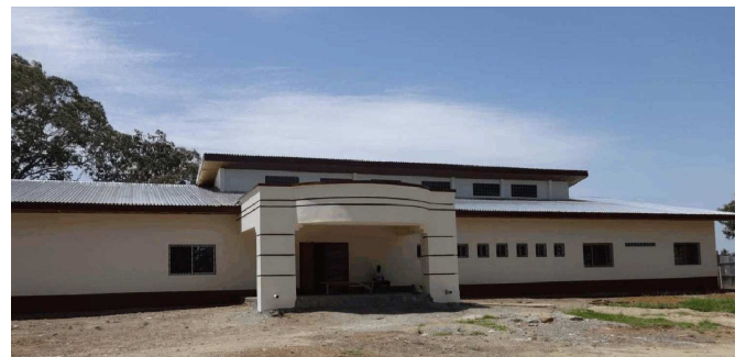
New ELWA Radio Studio

Work continues for Alan on the final phase of the studio (studio equipment, lightning protection, etc), so ELWA can begin producing programs in Liberian languages.