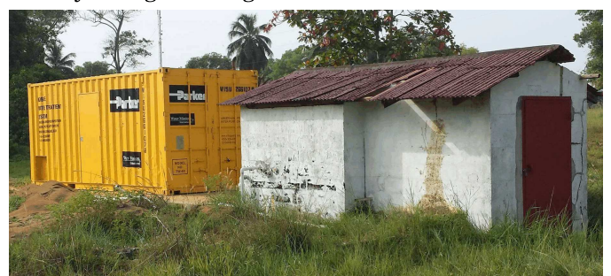
Waiting for installation: New water treatment system next to the old pumphouse.

The only thing missing at Radio ELWA is Alan!