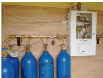
O.R. oxygen manifold and distribution system – no longer leaking!

system. (They even had him troubleshooting the sharps shredder!)