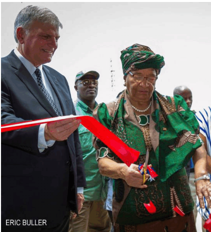
Cutting the ribbon – Franklin Graham with Liberian President Ellen Johnson-Sirleaf

On October 22 we celebrated the dedication of our new hospital, built by Samaritan's Purse. Liberian President Ellen Johnson-Sirleaf and Rev. Franklin Graham of Samaritan's Purse spoke at the ceremony.