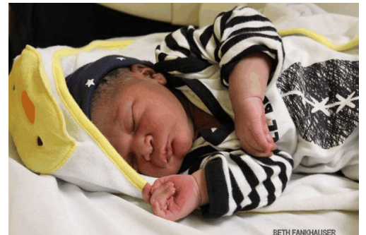
Three baby boys were born the first day!

Thank you, thank you for your part in this! The hospital also contains spaces for new doctor and nurses' training. It offers so much hope to Liberia. Pray that the missionaries and staff will serve the Lord as vessels of honor (2 Tim 2.21), entrusted with such an amazing gift through which to serve the people of Liberia.