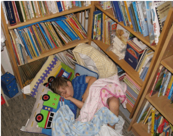
Caught sleeping in class!

grade, and 3 year old Zachary doing preschool activities as it suits him . ;-)