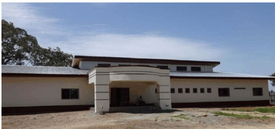
May 2014: Exterior complete

The additional program production space will enable programming in at least double the number of local languages being broadcast and the number of hours they are