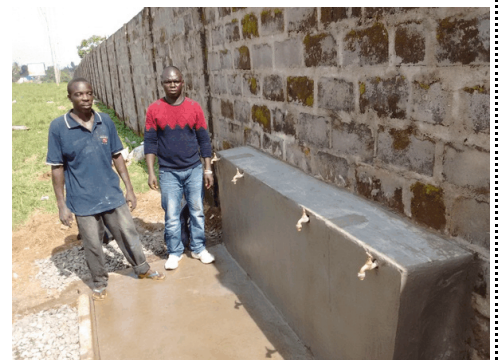
New faucets offering clean water to the neighboring communities.

He requested and supervised a project to install faucets outside the campus as well, so that the surrounding community has (free) reliable access to clean water. Our campus contains a lagoon which keeps our wells full of water even in dry season; many private wells in the area go dry for a significant portion of every year. (The ground water here is 85° during dry season, so a cup of "cold" water isn't possible, but that's ok!)