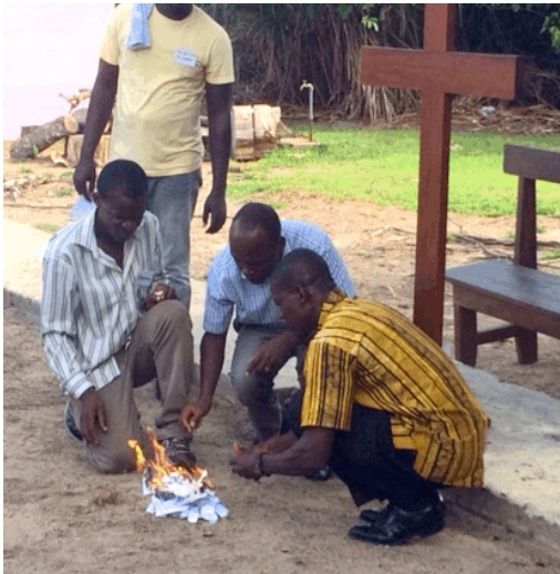
Trauma Healing: Bringing your pain to the cross

Trauma healing classes for adults and children continue to be held in several locations. Training for the leaders of the classes is held at ELWA.