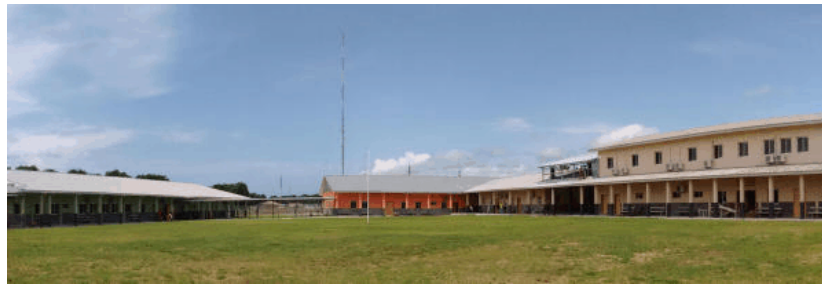
ELWA Hospital central courtyard

Then came new phone lines, security cameras, and a final check over the buildings to find areas still needing attention and adjustments with wiring, electric panels, battery backup, etc.— right down to the operating room lights and oxygen