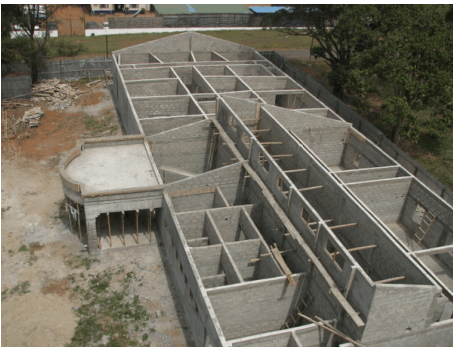
2014: 8000 sq. ft. studio in progress

Admittedly, the construction and opening of the hospital here has been close to all-consuming, but within the next 3 months we will begin the final phase of the new radio studio. The radio staff have been patiently waiting through the Ebola epidemic and the completion of the hospital for focus to return to the studio project.