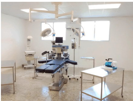
Operating Theater 3

For months Alan has been involved at all levels technical in the hospital construction. By September 26 the complex finally had electricity, after months of frustrating delays in receiving materials and equipment for running new power lines across the campus.